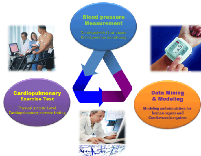
Fig:1 Data Mining in Healthcare

Data mining has many applications in the fields of telecommunication industry, financial data analysis biological data analysis and much more. With the growing research in the field of health informatics a lot of data is being produced. The analysis of such a large amount of data is very hard and requires excessive knowledge. E-healthcare applies data mining and telecommunication techniques for health diagnosis. There are some patients who require continuous check-up and might need doctor help immediately. E-health was primarily used for patient data analysis and disease diagnosis at various levels.