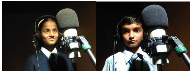
Figure 2: RODE NT1 microphone for recording speech

The database created consists of 1100 samples [11 digits x 10 persons x 10 samples]. The file format used to record speech is uncompressed file format and speech file is stored using .wav extension. Software Module used to record speech is RODE NT1 microphone using NUENDO 4 software module. The Figure 2 below shows RODE NT1 microphone used for recording speech.