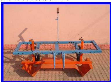
Fig. 1: MPT frame with raised bed attachment

The developed implement was tested in the experimental plots for sowing of wheat on bed. It was observed that the machine worked satisfactorily for sowing of wheat on raised beds. The developed implement could prepare the beds even in improperly prepared field having small sized clods. The raised bed formed by the developed machine could be apparently visible after operation as shown in Fig 3 and 4. The field test results of the developed raised bed planter are furnished in Table 2. The developed machine was effective for making raised bed and sowing seeds on them. The machine was found to be maneuverable and non-clogging if field was prepared properly. However, little bit of clogging was observed during field operation due to bigger size of clods. The average effective working width of the machine during field operation was recorded as 800 mm. The effective field capacity was found to 0.141 ha/h at an average speed of 2.21 km/h with a field efficiency of 77.19 per cent. The average draught required to pull the machine was found to be 63.49 kgf, which was within the capacity of local bullocks found in this region. The raised bed formed by the machine was of 148.30 mm height, 423.20 width and 146.10 mm depth. The width of furrow formed by the machine was found to be 209.90 mm.