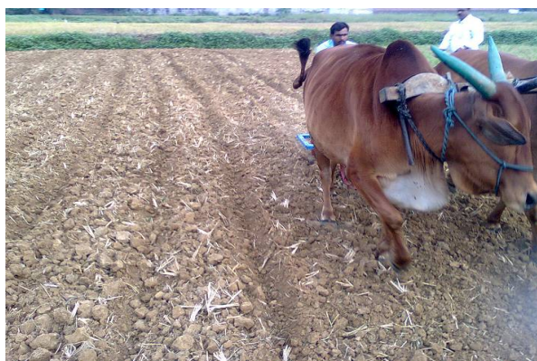
Fig. 4: Bed formed by developed machine

The raised bed planter developed under the present investigation worked satisfactorily for raised bed planting operations. The bed formed by the developed machine was satisfactorily as shown in Fig. 4. The performance of raised bed planter was found better than the corresponding traditional practices. This implement could save time, increased the efficiency and quality of operation. This implement is a versatile implement for raised bed planting field operations. The draught requirement of the developed implement was within the draught capacity of local bullocks.