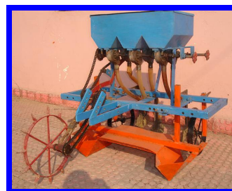
Fig. 2: View of developed Raised Bed Planter