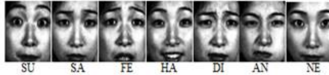
Figure 2: Sample pre-processed JAFFE images

To analyze the performance of subspace approaches JAFFE, database have been tested. Approaches like CEGKPCA, CEGLPP, CEGFLDA, CEGLFDA, CEGKLFDA, CEGKLSWFDA and CEGKGLSWFDA has been compared. Baseline feature vector dimensional parameters used to evaluate the performance of subspace approaches are given in Table 1.