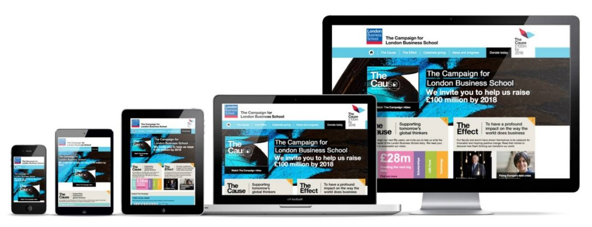
Figure 1: Responsive web pages for various screen resolution devices.

The main elements in the responsive web design are (Media queries, Fluid grid, Flexible images).