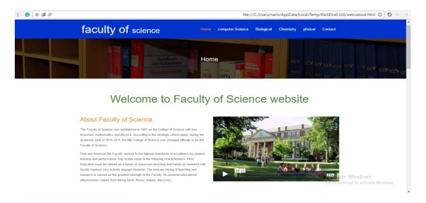
Figure 2: display the web page by using desktop browser.

The web page was testing by using public testing and passes browser compatibility. About the web page and testing and about implementation and checked it the webpage. After checking the web page with last version of browser like Mozilla Firefox, Internet Explorer, and chrome the work is complete and flawlessly. Moreover, by dealing with extra codes in browsers when it was increased in to HTML5 language document. That is needful and in order to compatibility about the web. In the below the last outcome by using in various viewports is described.