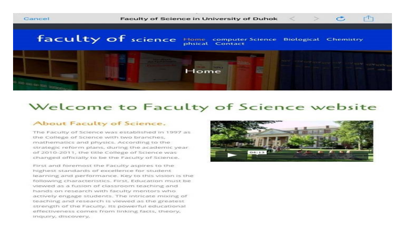
Figure 3 display the web page prototype on iPad Pro.

In figure 2 displays the last web page model by using the desktop browser. The resolution of a screen is more than 1024 pixels.