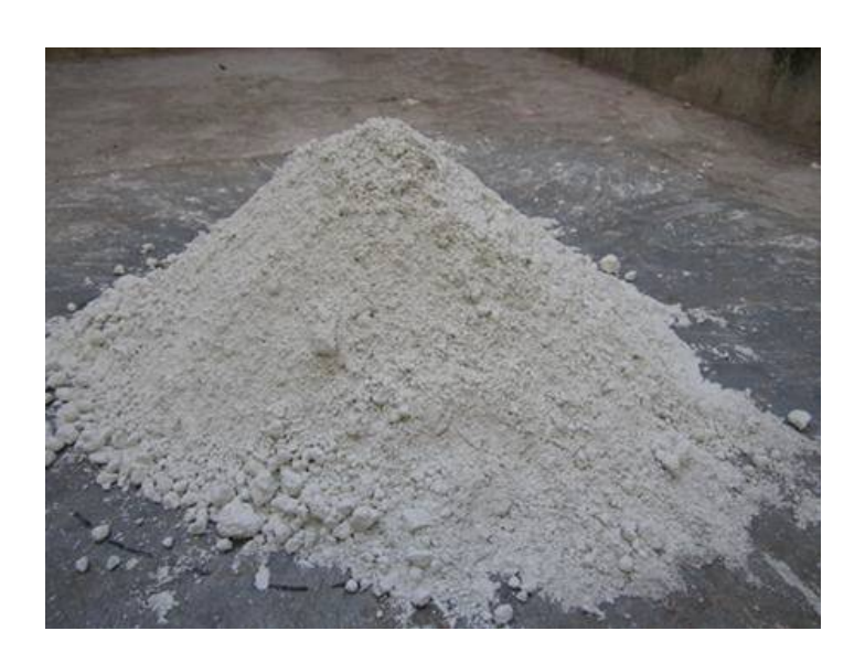
Fig 1. Hpyo Sludge