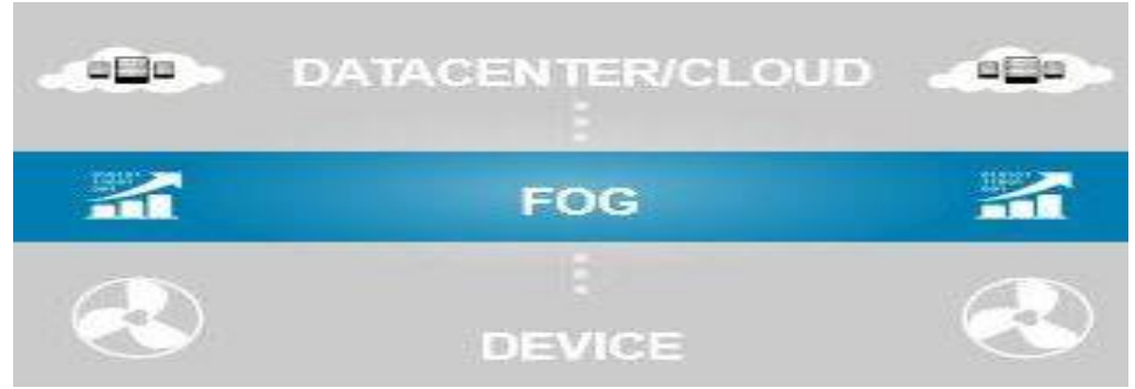
Figure 1: The Fog Extends The Cloud Closer To Devices Producing Data

IoT means everything talks to the cloud and all that big data we accumulate makes society more efficient than ever. One problem that we ran into with that plan was a lack of bandwidth. Solving the bandwidth problem that we're encountering with "the cloud" is remarkably simple. We simply create something called "fog computing" and insert it between "the cloud" and all our "IoT devices". It turns out that when you move a computer within close proximity of the device it's communicating with, the bandwidth improves. "Fog computing" is simply moving some of the computing power closer to the devices so that "the cloud" doesn't have to be consulted for every little minor detail. Many smaller time-sensitive computational decisions can be made by an intermediary device that then aggregates all the data it learns and sends that up to the cloud. It's kind of like decentralized computing all over again.