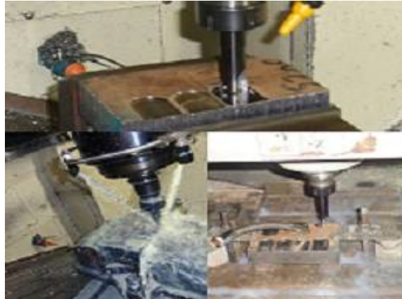
Fig. 2: Dry, 10%, Liquid Nitrogen lubrication strategies