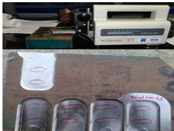
Fig. 3: Ti-6Al-4V (Grade 5) material with Surface Tester Machine

For the experimental verification of Roughness value, we are use following free-form model shown in Fig.3. All cases investigated were machined by 3 Axes Vertical Milling Center - MAKINO S56. The analysis of surface roughness on the basis of cusp height by using -Mahr surface tester.