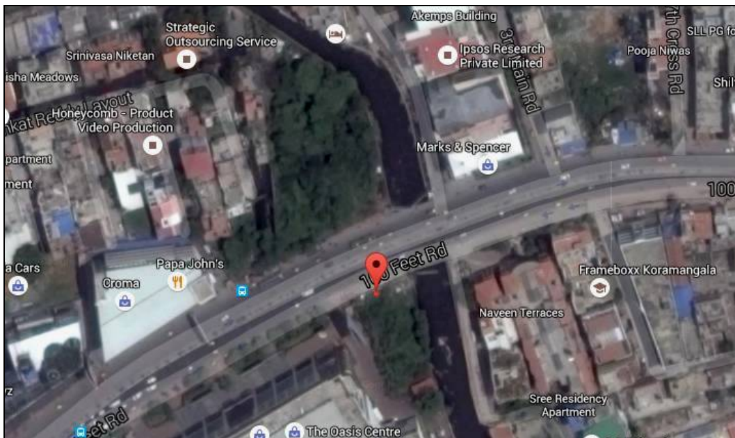
Figure: 2- Google map shows the property

There are three land portions. Two land portions which are to the North of 100 Ft ring road and measures 11615 Sq.Ft (under Sy. No.14 & 16) and 34101 Sft (under Sy No. 14) are adjoining each other totally measure 45716 Sft. A Rajakaluve runs along the eastern boundary of the land.