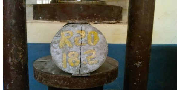
Figure 2: Split Tensile Strength of cylinder specimen