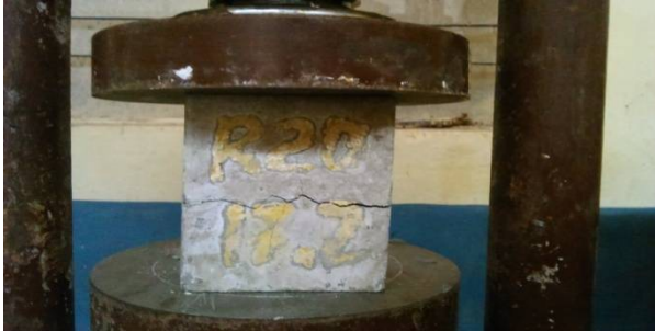
Figure 1: Compressive Strength of cube specimen