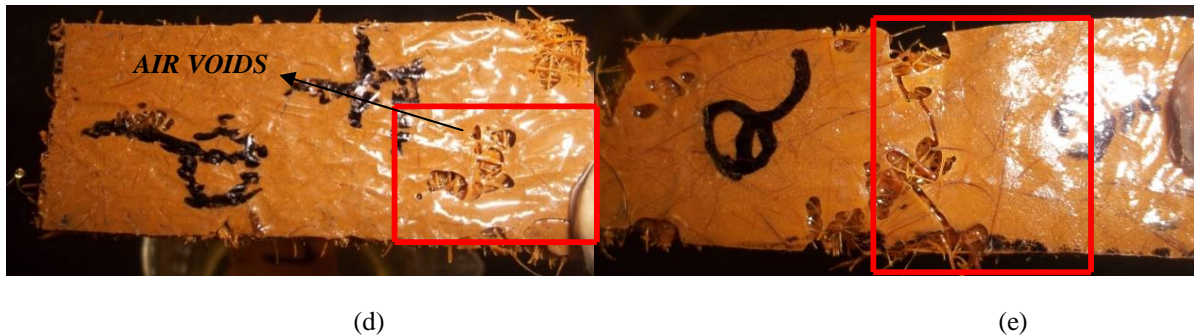
Fig 3 (a), (b), (c), (d), (e) Macroscopic defects observed in specimen

Fig 3(b) shows the partly bonded coir fiber with matrix material, where in remaining part of coir surface does not hold a trace of epoxy matrix in it. Due to weak bonding between fiber and matrix, fibers were subjected directly to external environment as in Fig 3(a) which resulted in higher water intake percentage. Higher water intake percentage has led to thickness swelling which developed cracks on specimen surface as in Fig 3(c). Weak bonding between fiber-matrix has developed machining difficulties causing matrix material to chip off from the fiber surfaces as in Fig 3(e), subjecting fiber to externalities. Air voids is one of the common defects that most of the materials experience due to unskilled and out-dated methodologies. It is more often in composites to have voids, cracks and flaws made by hand lay-up process. Libo Yan and Nawawi Chow [6]. Similarly air voids was observed in specimen surface Fig 3(d) which is a major defect that affects the mechanical performance and water absorption intake percentage. All the mentioned macro defects make composite laminate squander.