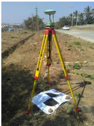
Figure 4: DGPS

Ground Control Points (GCPs) collection being the most deciding factor for accurate results, we have considered DGPS survey for the acquisition of the geo-coordinates on field. The Base station was setup and total 9 GCPs were surveyed for corridor stretch of 650m. Over each GCP we have placed a marker (fig4).