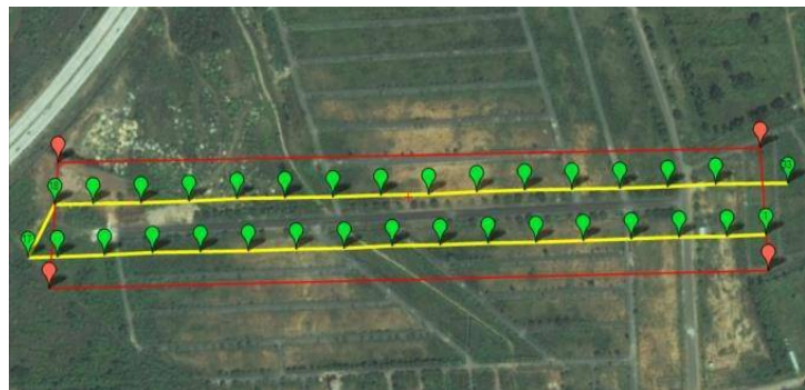
Figure 5: Flight planning

Flight planning for data acquisition is done by open source software Mission Planner (fig5). It is basically a ground control station for a drone and being used as a configuration utility or as a dynamic control supplement for your autonomous vehicle.