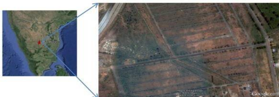
Figure 3: Study Area