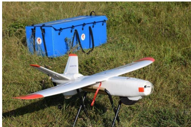
Figure 2: Skylark Osprey UAV