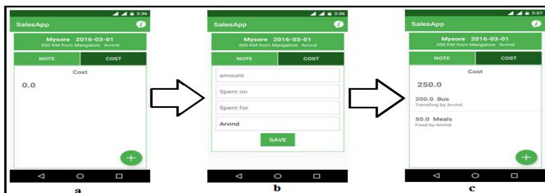
Figure 6: Add costs. a) Cost page. b) Add new cost page. c) Cost page with newly added costs.

Clicking on a particular trip on home page will display the note and cost page of respective trip. As shown in Figure 6, to add a new cost Sales Executive has to click on the plus icon in cost page. After that he needs to enter the details like amount, spent on and spent for. User name of android application will be selected automatically in spent by field. Clicking the save button will display the cost page with newly created costs. Also cost page will display the total of all the costs entered. To edit the cost details he needs to click on that particular cost in the cost page. Long pressing of a particular cost in cost page will display the cost delete option.