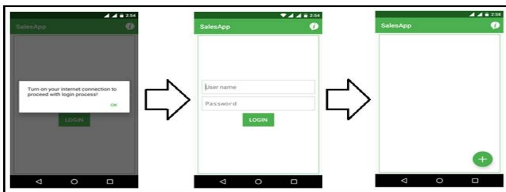
Figure 3: Login Process to Android Application

Initially android application will be installed in Sales Executive's android device. After that Sales Executive must undergo certain login procedures using the user name and password provided by sales manager. As shows in Figure 3, once he opens the android application it will ask him to turn on the internet connection. Internet connection is must during the login process to verify the user. If the login process is successful it will display the home page.