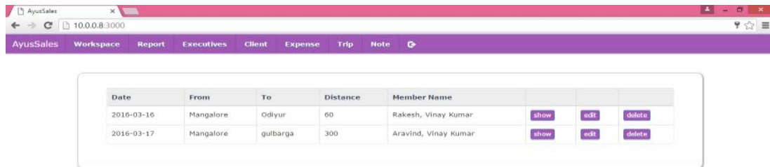
Figure 7: Web Application

each and every expense. Trip will provide date, source, destination, distance and trip members of each and every trip. Note will provide details like client name, client location, purpose of trip, status of trip and notes of each and every trip.