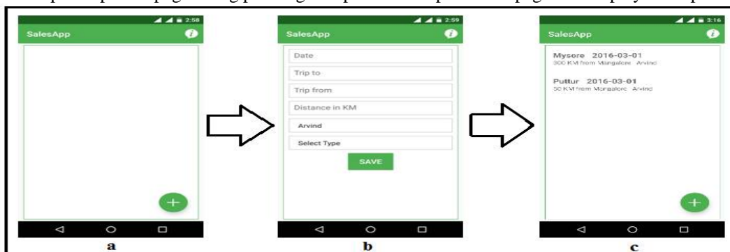
Figure 4: Create a new trip. a) Home page. b) Add new trip page. c) Home page with newly created trips.

As shown in Figure 4, Sales Executive can create a new trip by pressing the plus icon in the home page. In the next page he should enter details of the trip like date, source, destination, distance, trip members and trip type. App user name will be automatically selected by default in trip member field. In case more than one Sales Executives going for a trip, user can add them by ticking their name from the trip member list. Also Sales Executive has to select the type of trip using the dropdown available. Dropdown include options like sale, installation, and service. Once he press the save button it will be redirected to home page with the list of newly created trips. To edit the trip details he needs to click on that particular trip in trip view page. Long pressing of a particular trip in home page will display the trip delete option.