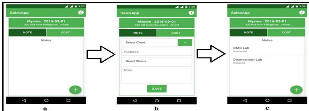
Figure 5: Add notes. a) Notes page. b) Add new notes page. c) Notes page with newly added notes.

edit the note details entered he needs to click on that particular note in notes page. Long pressing of a particular note in notes page will display the note delete option.