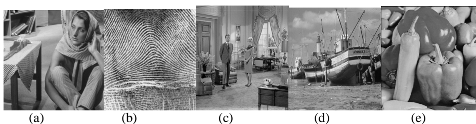
Figure 3: Test images (a) Barbara (b) Fingerprint (c) Couple (d) Boat (e) Peppers

A sufficient number of experiments are conducted to present the performance of the proposed model. Considering mixed noise, with standard deviation of AWGN varies as \sigma = 5, 10, 15 , the RVIN ratio as r = 5\%, 10\%, 15\% and the SPIN ratio as s = 30\%, 40\%, 50\% respectively. For these specifications, experiment is conducted on commonly used images as shown in Figure 3.