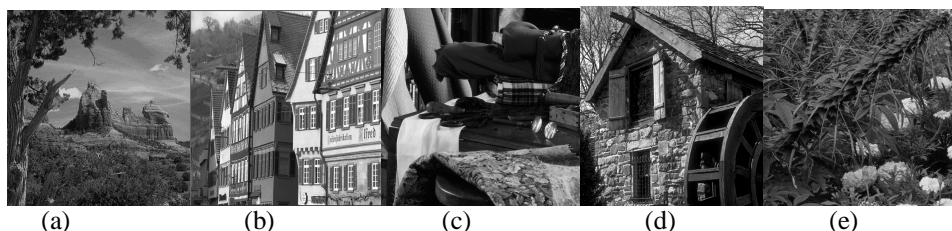
Figure 2: High-quality images

The residuals (r) for assigning weights (w) can be done in two ways. The residuals obtained from the pixels caused by AWGN are assigned with weights close to 1. The residuals obtained at other pixels corrupted by IN are assigned with smaller weights. Weights (w) and coding vector ( \alpha ) is updated by iterating the value of i. the weight (w) is updated using coding residual (r). The weights (w) can be initialised as,