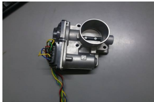
Figure 1: Electronic Throttle Body

The MOTOR Positive and MOTOR Negative are used to drive the DC motor which control the movement of the shaft of throttle.