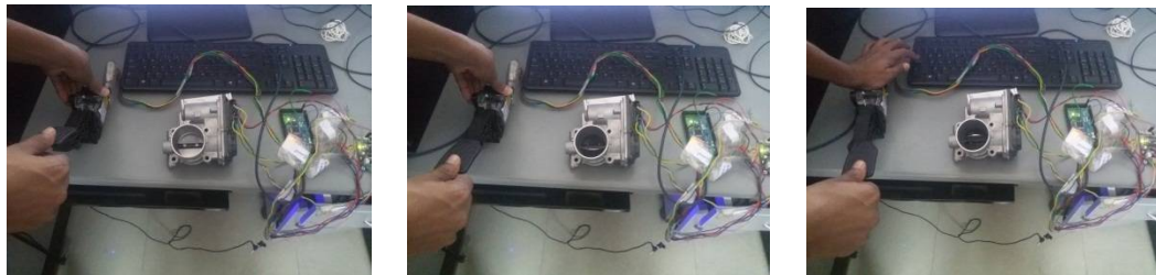
Figure 4: Setup of ETB

The complete setup enables us to operate the throttle valve with the help of input of accelerator pedal sensor with the help of PID controller by using single board computer. The mechanical linkage is eliminated. In the image we can observe the result. In the first image shows fully closed throttle which is the start condition of throttle which is slightly tilted. The second image is partially open which is will provide increase in the speed of vehicle. The third image is fully closed which will have highest speed of vehicle.