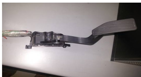
Figure 2: Accelerator Pedal Position sensor