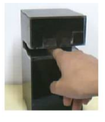
Image acquisition is defined as the act of retrieving an image from a source, usually a hardware-based source, which can be passed through whatever processes need to occur afterward.