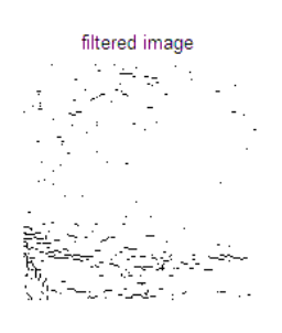
(g) Final image stored in database

In situation (1) both the values are equal so we can simply set C^2 code=Orientcode(v). If Orientcode is greater than the Magncode means then set Orientcode as a C^2 code else set Magncode as C^2 code. The resulting fusion map is named the comparative competitive code ( C^2 Code) [1].