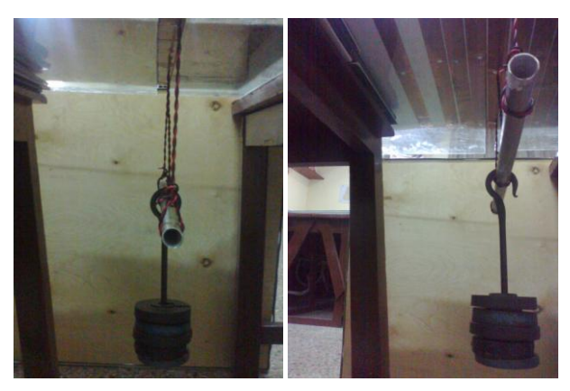
Fig. 5 Experimental arrangement for strength measurement of glued readout strip of the pickup strips panel.

Other experimental requirement is that these strips remain attached for a very long time and also we should know about strength of the connections. Connections made should not be affected by any kind of jerks and should last longer. For getting the answer of above mentioned curiosities, we have performed tests to check the strength of the attachment. For this purpose, we have arranged an experimental setup as shown in Fig. 5. In which we have hung some weights through the wires being soldered on the under test readout strips. We adopted gluing procedure as mentioned in sec. II. Here we soldered the wire to the strip made using a known adhesive as listed in Table 1 at three places over the strip and hung the weights in increasing order as shown in Fig. 5. The above mentioned procedure has been applied for each strip. The maximum weight is continuously hung for maximum time of 3 hours. The results of the above test are tabulated in Table 1.