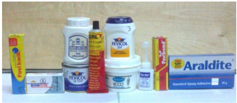
Fig. 2 Photographs of few adhesives used in making the readout strips panel.

We have searched for various adhesives available in our local market (so that it can be available very easily). We found that Band Aid Col (wood fixer, PVA emulsion), Bluecoat 9000 (Synthetic wood adhesive), Fevicol SH, Fevicol SR 998 (Synthetic rubber adhesive), Fevi Kwik, Fevibond, GRL Tyre and tube repair, Bondtite, Flex Kwik and Araldite are possible locally available adhesives. The photographs of these adhesives have been shown in Fig. 2. Brief information about these adhesives has been listed in Table 2.