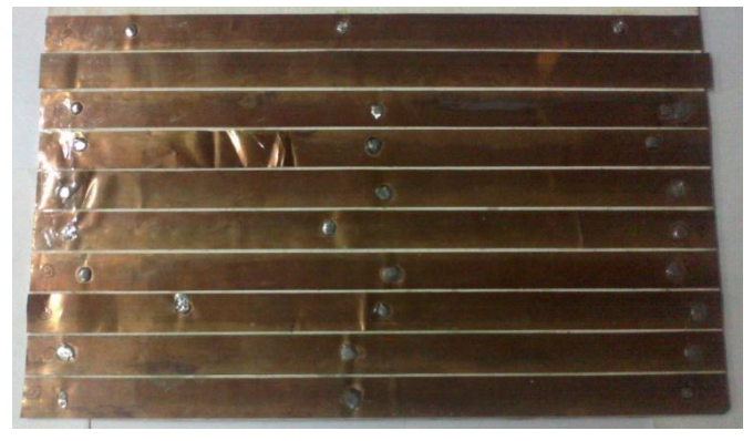
Fig. 3 Test readout pickup strips panel made up by using different adhesives.

Using these adhesives we have made up a test readout strips panel for further experiments, as shown in Fig. 3. In its making we have attached Copper strips using the above mentioned different adhesives. But for making its ground plane (by attaching the Aluminium foil) we have used the Araldite as a common adhesive, because it has good attaching property. After attaching them we have pressed the panel's strip with some weights using lead bricks for 24 hours.