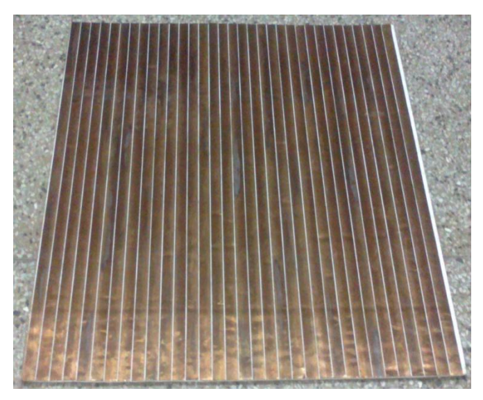
Fig. 1 Image of 1 m \times 1 m Silicon Fiber Sheet based readout strips panel.

Since, we have tested that Araldite is a very strong adhesive although its cost is very high. In this paper we have described the experiments by which we have chosen the appropriate adhesive for our purpose of making the readout strips panel at a large scale. This work will be basically useful not only for INO-ICAL (Iron Calorimeter) experiment but also for other experiments in which they need to attach the metallic foils. If attachment work is very small then use of the Araldite adhesive may be preferred because it is very well known and well tested adhesive for attaching very hard materials such as Iron sheet, Glass sheet and Stones etc [3].