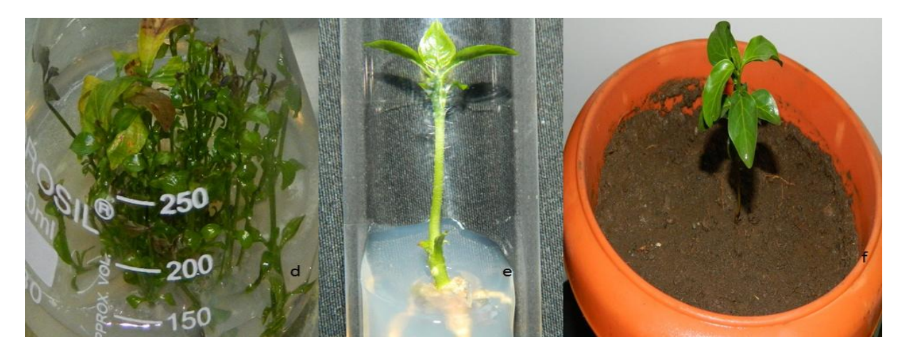
Fig. 2. (d) Development of shoots after four weeks. (e) In vitro regenerated roots. (f) Acclimatization of plantlets. The plantlet is successfully transferred to soil after hardening with a 70% survival rate. Acclimatization is the final step in a successful micropropagation system. During this stage plants have to adapt to the new environment of greenhouse or field. The plantlets usually need some weeks of acclimation in shade with the gradual lowering of air humidity [12].

NAA is widely used for induction of roots on regenerated shoots of medicinal plants like Adathodavasica [8], Hemarthriacompressa [9], Tavernieracuneifolia [10]. Similarly, IBA promoting rooting in Hebe buchananii (Hook) [11]. Direct multiple shoots were regenerated successfully and a single shoot was transferred on rooting media. 2 - 3 cm long plantlet with 4 - 5 leaves and roots then acclimatized successfully (Fig. 2).