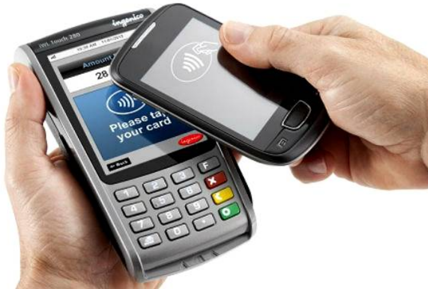
Figure 1: NFC Micropayment

As credit card has no batteries it is not able to initiate the transaction, limiting the contactless possibilities. NXP Semiconductor splits contactless applications into four categories based on how consumers will use applications. The first two are possible without batteries. The categories are: