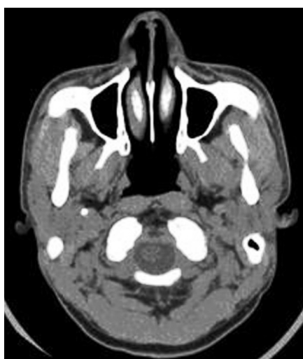
Fig. 3 CT scan image used in the research work.

BTC based CT-scan image compression is carried out to estimate the compression ratio and image quality parameters. Square truncation matrixes are used ranging from 8bit to 1024 bits. Figure 3 shows the original CT-scan image used for compression.