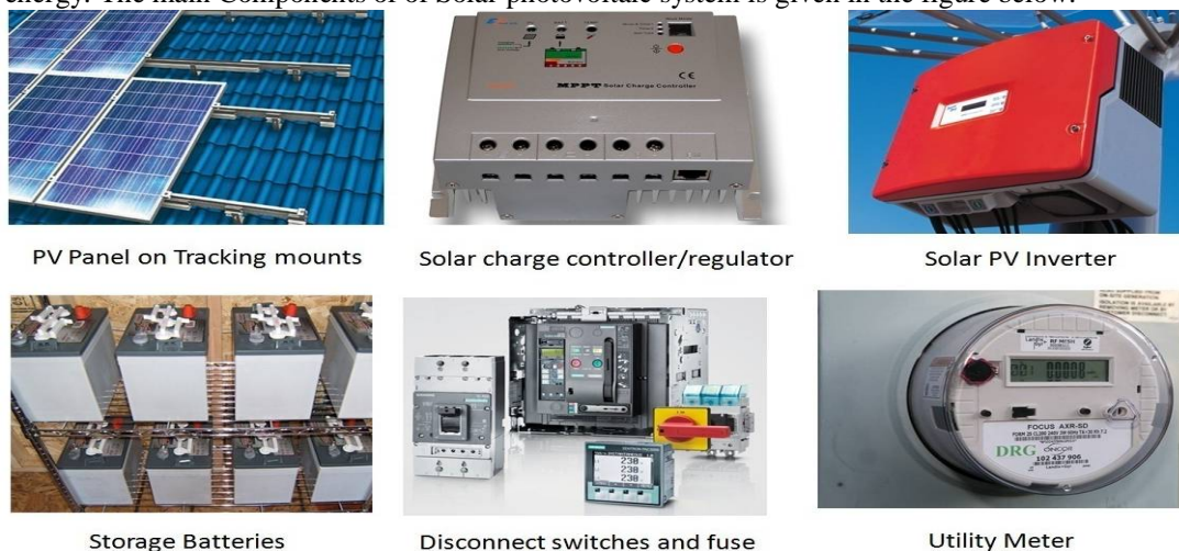
Figure 1 Components of Solar Photovoltaic system

Photovoltaic converters are semiconductor devices that convert part of the incident solar radiation directly into electrical energy. The main Components of of Solar photovoltaic system is given in the figure below: