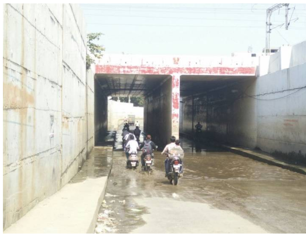
Figure 1: RUB water logging problem (Gujarat, India)

The monsoon is highly important for India as it fills up water reservoirs, replenishes ground water and is essential for the Indian agriculture of which around 70% are rainfed. Every year the newspapers report about the exact date when the rains are expected to start and whether the monsoon has brought more or less rain than in the years before. As the rain falls the water accumulates from the surroundings catchment area i.e. approach road of RUB and gets clogged in it, this creates problem for the road users during monsoon.