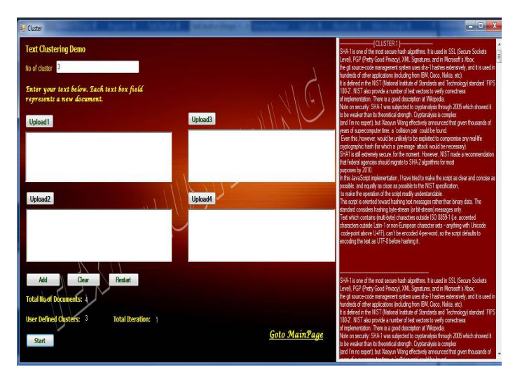
Fig.4.2. Clustering output

The above screenshot fig 4.2 describes about the clustering page where the user can browse and upload files. Using the clustering page we can upload up to 4 files to text documents. After the adding we can add no. of clusters and the clusters are formed with the similar type of data it gives the resulting clusters beside of the page it performs certain operations like find clusters, , browse files, and upload files, no. of clusters.