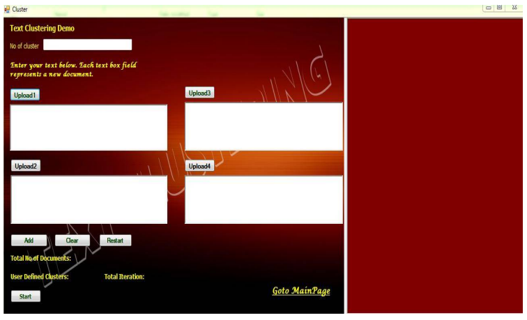
Fig.4.1. Clustering Page

At the end point we need to implement a buffer which needs to be collecting the split packet in a list having address field and data field. Value field store the data and address field store the address of next split. If one split in the order we don't get means some –ve ack signal need to send. For that purpose once again we need to call socket listener class and create object for that class and send the request in a form of stream. And client need to resend that corresponding packet once again .This process is repeated process for that purposes we need some source code of data.