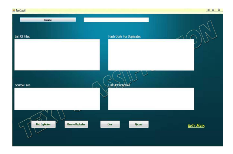
Fig.4.3. Classification page

The above screenshot fig 4.2 describes about the clustering page where the user can browse and upload files. Using the clustering page we can upload up to 4 files to text documents. After the adding we can add no. of clusters and the clusters are formed with the similar type of data it gives the resulting clusters beside of the page it performs certain operations like find clusters, , browse files, and upload files, no. of clusters.