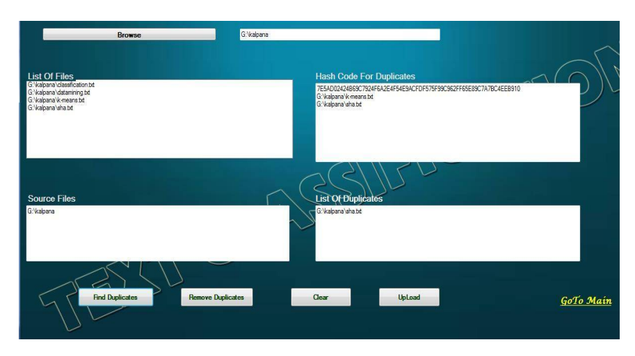
Fig.4.4. Classification upload page