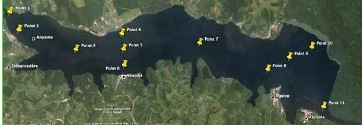
Fig.1: Sampling locations map

to investigate the possible influence of Mé river on biological communities of lagoon. Stations were selected nearest DjibiBete and Mé rivers to assess the rate of exchange in different backgrounds.