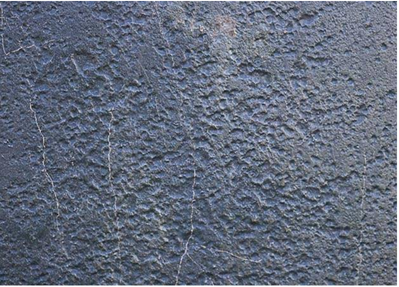
Figure 1- pitting action in wall of impeller due to cavitation

The end result of cavitation is the collapse of the vapor bubbles inside the pump, which can cause several problems. The first problem is a reduction in the pumping capacity of the pump. If the pump is unable to keep up with the incoming flow, then an overflow situation may occur. Cavitation also causes damage to the pump. The collapsing vapor bubbles can cause excessive vibration, which can cause rotating parts, such as the impeller, to contact non-rotating parts, such as the wear plates or wear rings, causing damage. Excessive vibration may also cause premature failure to mechanical seals and bearings. Cavitation can also damage the wetted components themselves from contact with the imploding vapor bubbles. In these instances, the energy that is released when the vapor bubbles implode causes pieces of the metal to break off and collide with other moving parts. The damage typically occurs to the impeller and can severely reduce the operating life of the pump.