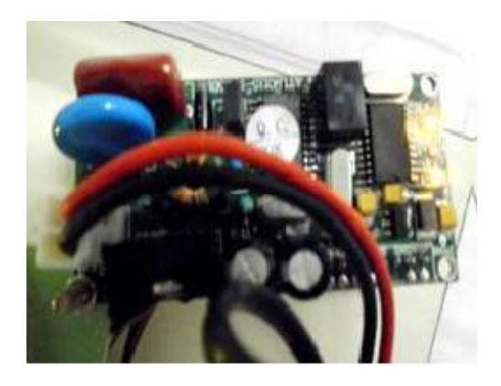
Fig.3 power line communication modem

PL modems transmits the data in digital from inside the building using the live and neutral cables which are used for distributing power. Carrier frequencies will be ranging from 50 to 500 kHz based on the modulation technique such as ASK (amplitude shift keying), PSK (phase shift keying), FSK (frequency shift keying), BPSK (binary phase shift keying) and DSSS (direct-sequence spread spectrum) PLC uses different frequencies based on the data transmitted over the power lines. Lower baud rate will be used for long distance communication with few hundred bits of data rate. The shorter distances will be covered by high baud rate which operates on millions bits. Figure 3 shows PLC Modem