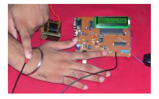
Fig. 4 Prototype Model for measuring Biosignals

Heart rate sensor and LM35 sensor senses the heart rate and temperature of person(normal beat is 60-100bpm and 98.6oF) and the data is transferred to MCU. MCU stores the digital data after converting the analog data from sensor unit through ADC, for some delay unit of time and resets the reading in MCU as well as in LCD also. MAX232 receives the digital data and converts into serial form suitable for GSM communication so that data is received by the user doctor. The doctor advises precautions for the temporary observation of the patient from serious condition. The system will improve the structure of traditional patient monitoring systems. The intelligent patient monitoring systems will posses more flexible architecture. Thus, the fast data monitoring can be achieved through the proposed system. The power line as a communication medium could also be a cost-effective way compared to other systems because it uses an existing infrastructure, wires exists to every household connected to the power-line network. Physiological parameters were measured using prototype model as shown in figure 4.