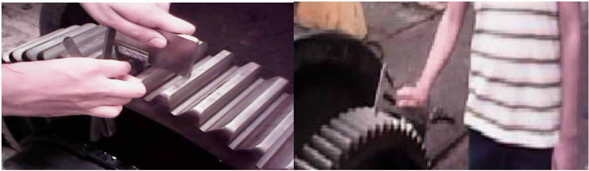
Fig. c. Measurement of P-Value, K-Value and Backlash of Axle Gear Box

(An ISO 3297: 2007 Certified Organization) Vol. 5, Issue 6, June 2016