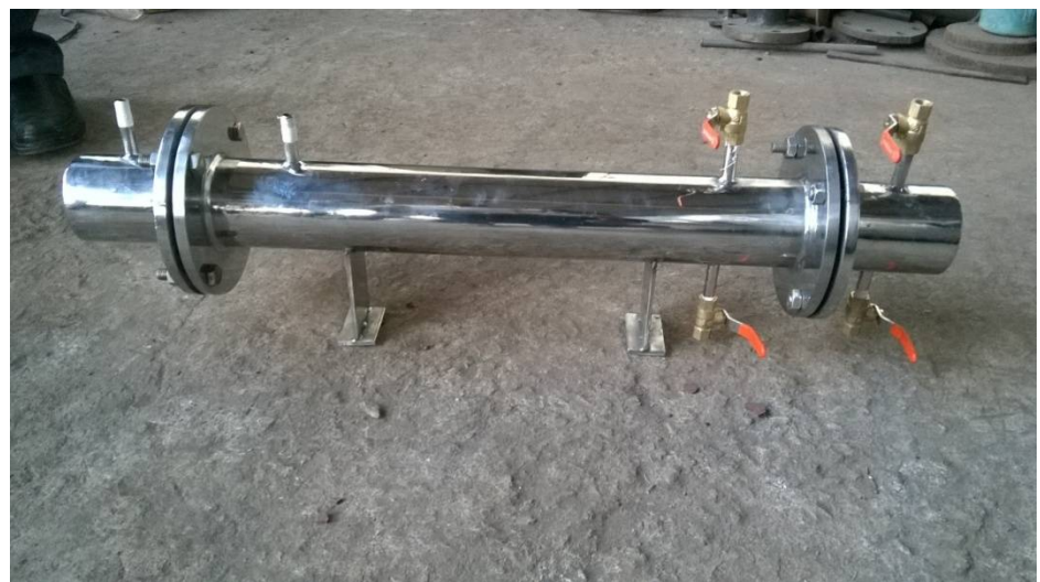
Fig 3: Experimental Setup

The heat exchanger used for the experiment is shown in the figure 3. In this experiment two different cases were taken into considerations to find effectiveness. The first experiment was done by sending the hot water through the shell and cold water through the tubes. The second one was done by sending the cold water through the shell and the hot water through the tubes.