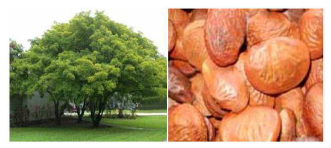
Fig. 1: Karanja Tree and seeds [13]

Vegetable oils are produced from numerous oil seed crops. While all vegetable oils have high-energy content, most require some processing to assure safe use in internal combustion engines [12]. Karanja tree and seeds can be seen as shown (Fig. 1)