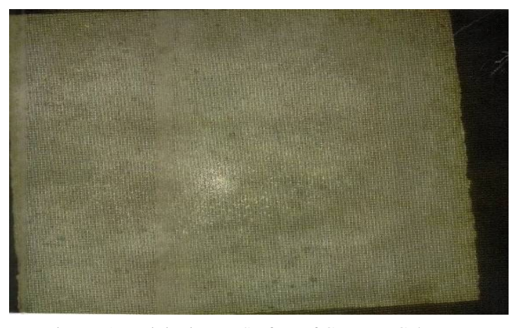
Fig no. 5 Precipitation on Surface of Concrete Cube.

Table no . b,c,d,e Show the Copressive Strength of Material Cubes tested for compressive Strength in compressive testing machine. 7 & 28 Days for defferent Bactertia, Calcium source using bye defferent method. For control mortar cubes.