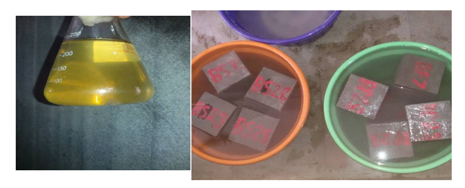
Fig No. 1Nutrient broth solutionFig No. 2immersion of Sample in Precipitation of Media

Figure 1 shows Nutrient broth solution my be used for the general cultivation of less fastidious microorganisms, can be enriched. With blood or other biological fluid. Figure 2 the mortar specimens after de-molding ware immersed in triplicates in respective bacterial solution grown overnight separately 24 hrs.