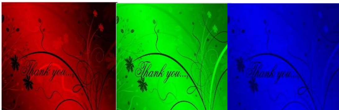
Fig: 1 Hello.bmp (a)Red plane

The performance of the proposed algorithms is evaluated by conducting experiments pixel value differencing for color image as shown in the figure where embedded image along with original image is shown with RGB planes.