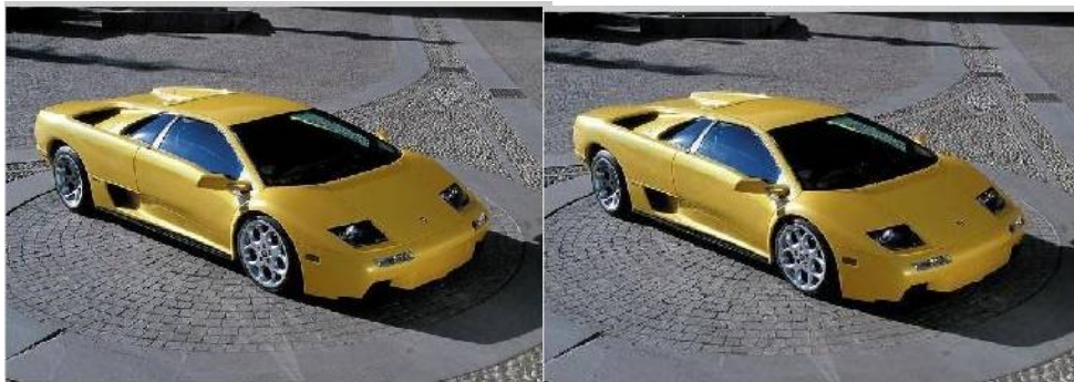
Fig. 4(a) Cover image