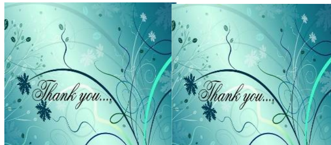
Fig:2 (a) Cover image

As shown in figure 1 it represents the RGB planes separated where we get 8 bits for each pixel for data embedding purpose. Here pixel value differencing and discrete cosine transformations techniques are used for data embedding.