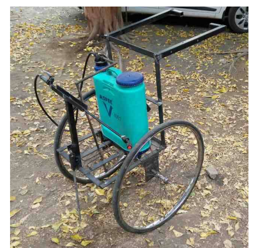
(Figure-3. Actual Assembly of Prototype with changes in Design)

As depicted in figure-3, the mechanism will be kept at rest on the stand when not in use. The stand is available at the front end of the trolley. Whenever it is desired to move the trolley, the stand will be lifted up and the mechanism will pulled to operate. The weight of the trolley, pump and mechanism is entirely taken up by the bearings mounted on shaft of the wheels.