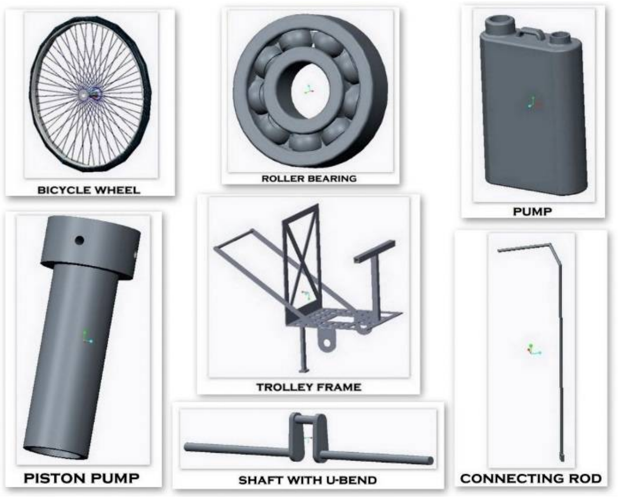
(Figure-1. 3D Views of Different Components used in the Mechanism)

The mechanism will be mounted on the trolley having two large wheels. The conventional sprayer will also be mounted on the trolley base with its pumping handle removed. The slider in this case will be the piston pump of the sprayer. The connecting rod, which will pump the sprayer because of its reciprocating motion and which will be directly connected with the piston pump using a pin joint (in place of the handle removed). The shaft of the trolley will become the crank which will rotate when the trolley will be pulled by the user.