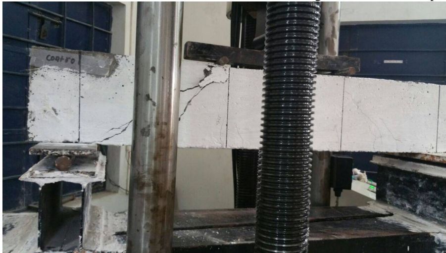
Figure (3) Closer View of Plain RC Beam without Fiber

The Figure (3) showing the formation of shear cracks at the end supports of the beam which is due to propagation of flexural cracks. Shear cracks are formed usually near the edge of the support conditions and the control beam is failed due to flexural-shear failure. The control beam is without fibers and without glass fibre reinforced polymer laminate.