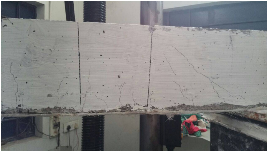
Figure (4) Closer View of HFRC Strengthened Beam

The Figure (4) showing the formation of flexural cracks at the mid-span of the beams and later on it extended till the shear end of the supports. The control specimen failed under the formation of shear cracks at the supports. HFRC beams are strengthened by glass fibre reinforced polymer laminate of single layer.