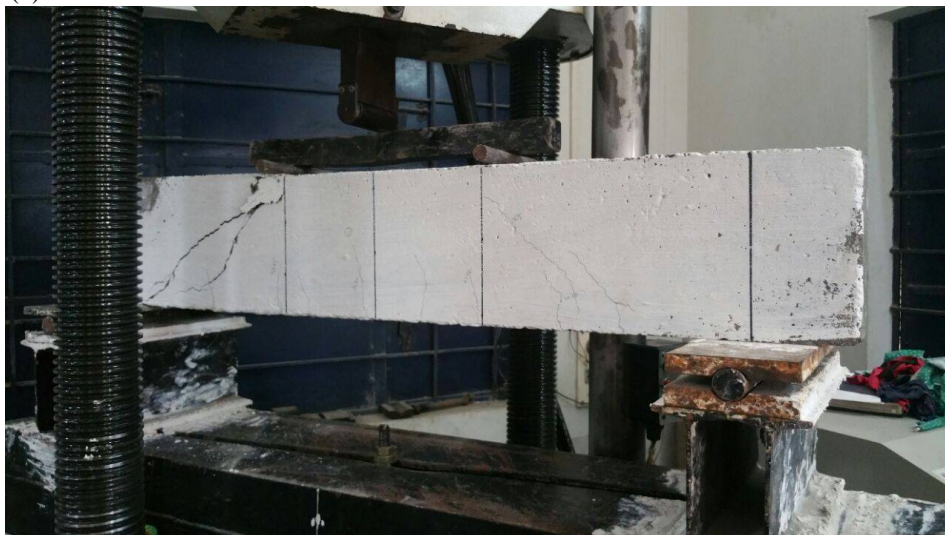
Figure (5) Closer View of Shear Crack at Supports in Strengthened HFRC beam

The flexural cracks initiated in the pure bending zone as expected. As the load increased existing cracks propagated and new cracks developed along the span. The flexural cracks gave way to inclined cracks due to the effect of shear force as shown in figure (5).