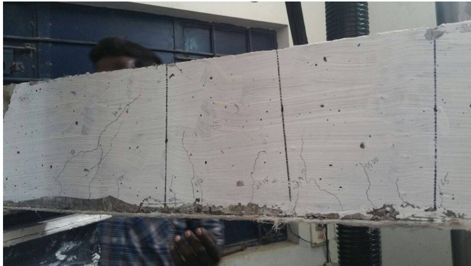
Figure (6) Closer view of Flexural cracks in Strengthened HFRC beam