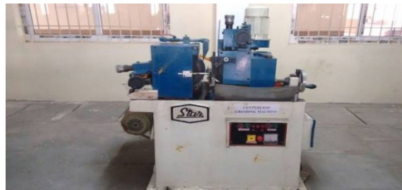
Figure 1 – Centerless Grinding Machine

Star make model centerless grinding machine is used for the experimental work.