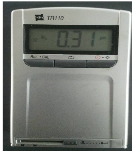
Figure 2 – Surface Roughness Tester

The surface roughness is measured by using MITUTOYO make surface roughness tester. The length and diameter of work piece is measured using Vernier caliper. The surface roughness tester is shown in fig 2. The device sophisticates measurement of surface roughness interms of microns for three different travel lengths.