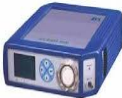
Figure 2 - AVL 444 DiGas Analyzer

The modeled view along with dimensional details of the proposed gasifier is shown in the figure 1. The actual fabricated view is shown as well. In the prepared experimental set up, the outer cover is paced in order to reduce the unwanted air current flowing into the equipment. The outer cover is air tight. The gasifier is operated and the ashes are removed only after the entire processing is completed.