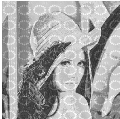
Fig 5. Watermarked Image