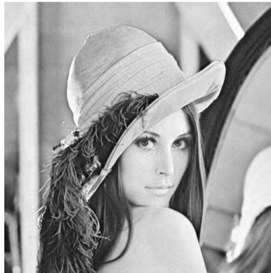
Fig 3. Original image