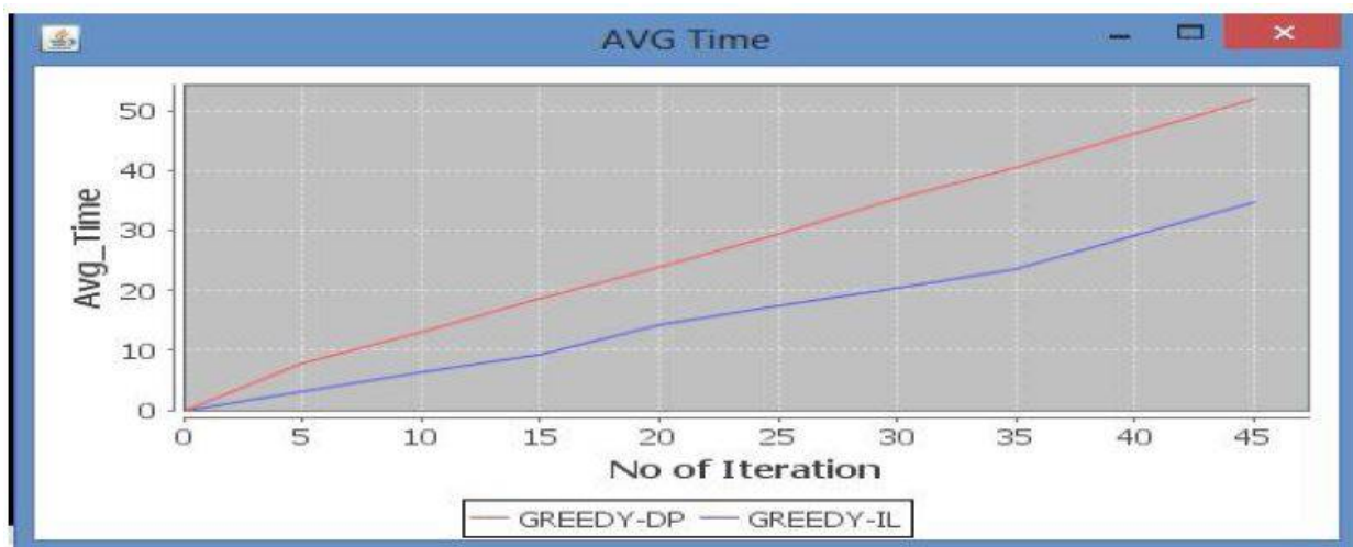
Fig No 03 graph for average time

In the figure 4.3 shows the graph comparison the common time for greedyDP and greedyIL. The x axis denoted range of iteration and y axis denoted average time. The greedyDP have high average time whereas comparison with greedyIL. The greedyIL is best than greedyDP.