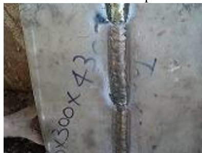
FIGURE 5 weld bead under plain welding