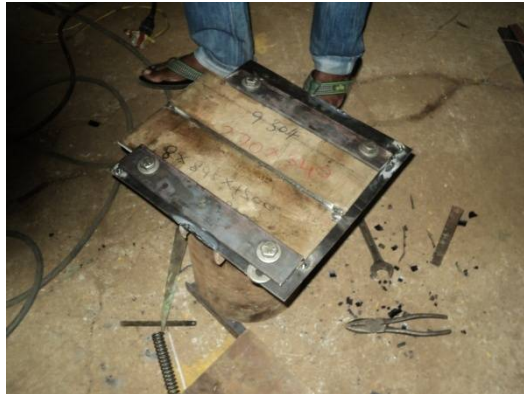
FIGURE 1 EXPERIMENTAL SETUP

AISI 304 specimen used for this research comprises of 6mm thickness plate , 8mm thickness plate and 10 mm thickness plate. The size of the AISI 304 specimen used were 300 x 150 and the each thickness consists of three specimen. The welding method used in this study is shielded metal arc welding and the electrode used was SS 304 . The welding current was 60A and the voltage used were 85V , the traveling speed was 126mm/ min .The diameter of the electrode used was 3.14mm. The frequency was maintained at 100Hz during vibration welding . The specimen was first subjected to edge preparation . The edges were beveled to an angle 30^{\circ} in a shaping machine. Single V groove is maintained in all the specimen. There were totally fourteen specimen pieces and two plates are paired together to give seven pairs. The steel pieces with smooth and uniform bevels were cleaned of oxides, rust grease and paints by sand grinding. The cleaned