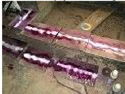
FIGURE 4 Dye penetrant testing

any vibration. At the end of root weld the weldment was subjected to dye penetrant test and any surface defects were removed by grinding. Next one specimen in 6mm and 10mm plate were welded completely in vertical position without any vibration. This for the reference purpose. The macro and micro properties of the specimen in which the welding is carried out under vibratory condition is compared with the values so obtained for specimen welded without any vibratory condition. Next one specimen in each of the thickness is welded under the vibratory condition under the frequency of 100 Hz and at the maintaining the amperage of 65A. Subsequently another remaining specimen in 6mm and 8mm were welded under vibratory condition with the same frequency but altering the ampere to 80A . The change in amperage will result in change in the welding speed. It was observed that the 6mm thick plate required one root pass and another finish pass. On the other hand 8mm and 10mm plates required in addition to one root pass another two passes for finishing. At the end of each of pass weldments were subjected to dye penetrant test and defect were removed.