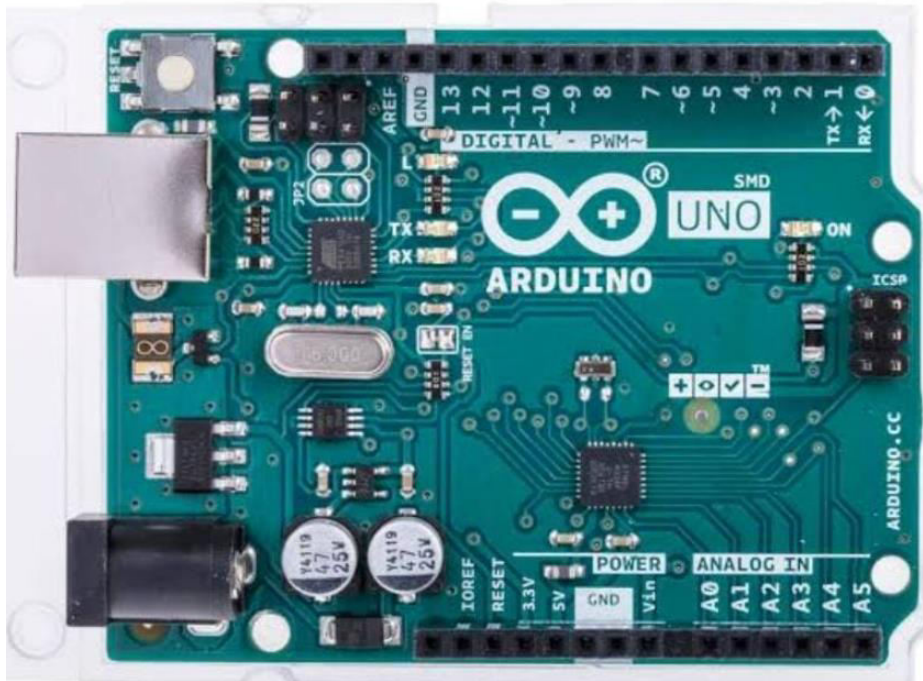
Figure 4.1: Arduino Uno [22]

The Arduino Uno is the ideal board to use while beginning to program embedded systems. If you're new to this field, this Arduino Uno board is excellent for tinkering. For this open-source Arduino platform, the whole schematic and PCB layout are accessible online. A Google search may also yield a lengthy lecture on an Arduino Uno Internet of Things and home automation project. All Arduino boards can be programmed using the free Arduino Software Development Environment (IDE). You can download the Arduino Software Development Kit (IDE) for Mac, Linux, and Windows operating systems. Rumor has it that third-party smartphone apps are available for Arduino Board programming. I'm glad to hear this.