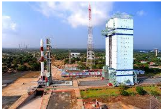
Figure 1: First Launch Pad

The modern First Launch Pad was inbuilt the early Nineties for the Polar Satellite Launch Vehicle. it's additionally been utilized by the geosynchronous Satellite Launch Vehicle. the 20th launch from the pad - a PSLV-XL with IRNSS-1A - occurred on one Gregorian calendar month 2013. the primary Launch Pad of the Satish Dhawan space Centre may be a rocket launch web site in Sriharikota, Asian country that began operation in 1993. It's presently utilized by two launch vehicles of the ISRO. The Polar Satellite Launch Vehicle (PSLV) and therefore the Geosynchronous Satellite Launch Vehicle (GSLV). It's one among two operational orbital launch pads at the positioning, the opposite being the Second Launch Pad, that opened in 2005. The primary launch from this pad occurred on 20 Sep 1993, and was the maiden flight of the Polar Satellite Launch Vehicle carrying the IRS-1E satellite.