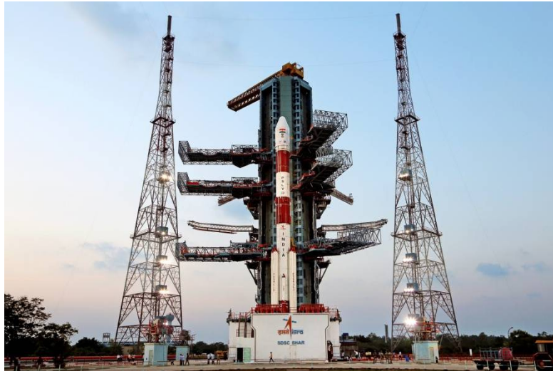
Figure 2: Second Launch Pad