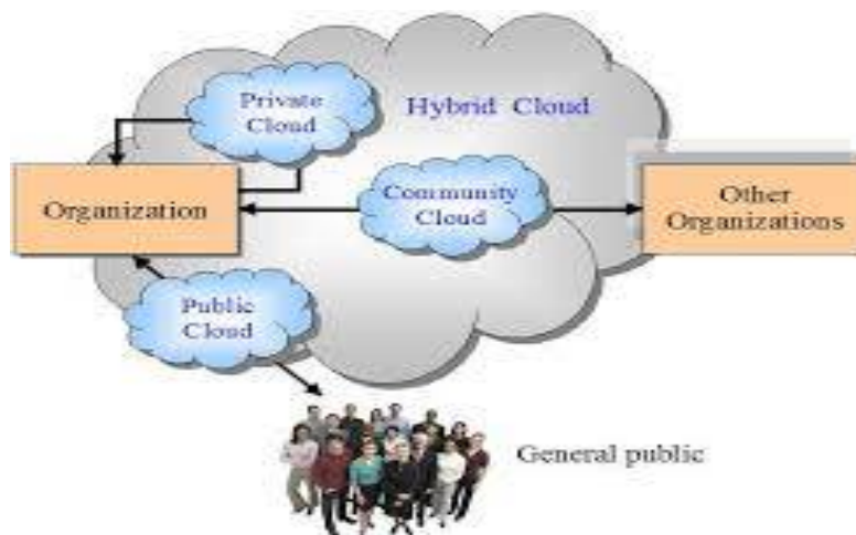
Figure 2: Cloud Deployment model

Finally, NIST recognizes four diverse types of deployment models for the prior service models. There are