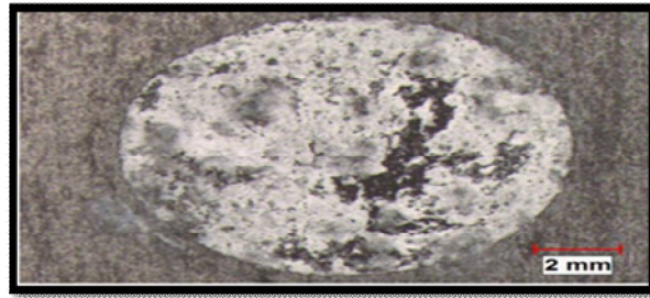
Fig 4.1 Stereoscope graphs showing the corroded surface morphology