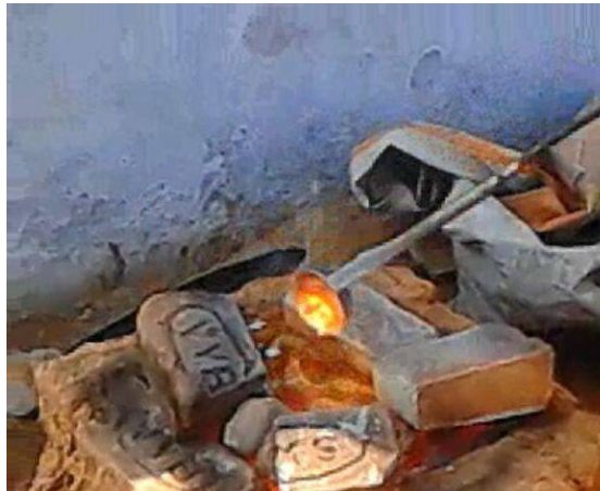
Fig: 1- Preheating of Reinforcements

Reinforcements such as Graphite and Boron Carbide were preheated at a specified temperature 30 min in order to remove moisture or any other gases present within reinforcement. The preheating of also promotes the wettability of reinforcement with matrix. Reinforcements are added as 5% and 10% composition with Aluminium 2024. The Preheating of Reinforcements in furnace is shown below.