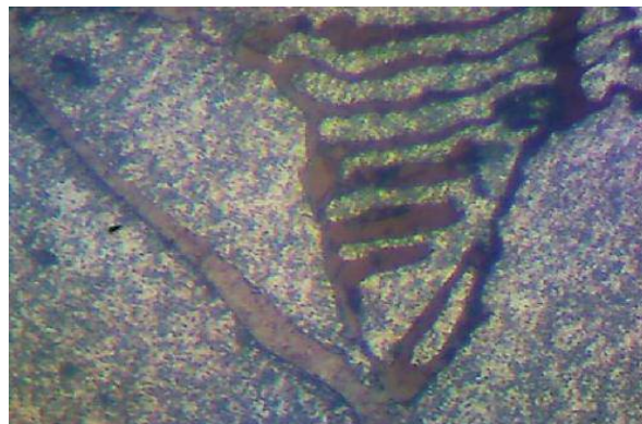
Fig 3.3 Microscopic image of Al-B 4 C-Graphite (400 x)