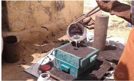
Fig: 2-Pouring of molten metal into the Mould