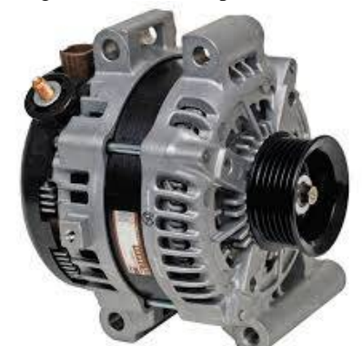
Fig 1.3 14.2V Lucas TVS Alternator

An alternator is an electrical generator that converts mechanical energy to electrical energy in the form of alternating current. A conductor moving relative to a magnetic field develops an electromotive force (EMF) in it.