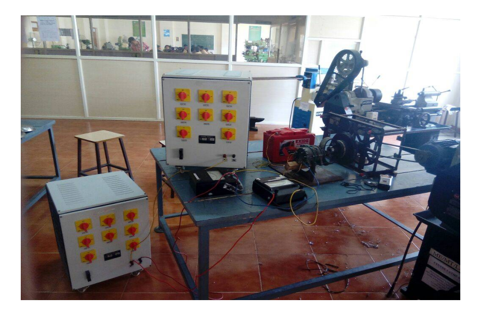
Fig 1.4 Assembled view