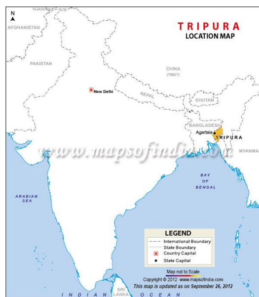
Fig. 1. Location map of Agartala (Tripura) in India

Agartala station (IMD code No. 42724) is situated Tripura state (northeast India), which is bounded on the eastern sides by states of Assam and Mizoram and on the north, west, south and southeast by Bangladesh. Agartala ( 23^{\circ}53' N Latitude, 91^{\circ}15' E Longitude and elevation of 16.00 m above mean sea level), a humid site, has received heavy monthly total rainfall varying from 914.10 mm (June) to 109.96 mm (July) during June to August in monsoon season. The location of Agartala site is shown in Fig. 1. The annual data of total rainfall were collected for last 103 years (1901-2003) from India Meteorological Department (IMD) Pune, Maharashtra. Similarly, the data of the 24 h maximum rainfall of Agartala were also obtained for the duration of 103 years from 1901 to 2003 from IMD. There were two missing values, and these missing values of total rainfall in a year were replaced by the average annual rainfall of Agartala. Mean monthly temperature and relative humidity over Agartala is found to be about 22.6^{\circ}\text{C} and 76% respectively. Also, mean monthly values of wind speed, sunshine duration and pan evaporation over Agartala are 5.9 km/h, 6.4 h and 3.7 mm/day, respectively (Jhahharia et al., 2009).