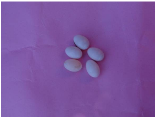
Figure 2: Clutch of 5 eggs

A total of 24 clutches of Spotted Munia were observed during present study. The clutch size during this study revealed variations from minimum 5 to maximum 7. Among 24 clutches, there were 5 nests (20.84%) with clutch size 5, 8 nests (33.33%) with clutch size 6 and 11 nests (45.83%) with clutch size 7. Thus nest with clutch of eggs 7 were significantly more common ( Table-1 ). In contrast according to [13] and [14] clutch size of Spotted Munia ranged from 4-6 eggs and 4-8 respectively. However, [15] recorded clutch size varies from 4 to 10. Furthermore, the clutch size revealed variation from 6 to 7 with mean 6.25 \pm 0.51 in Bishnah station, 5 to 7 with mean 6.55 \pm 0.72 in R.S pura station, and 5 to 6 with mean 5.42 \pm 0.53 in University Campus ( Table-2 ). Earlier [16] during his three years study, recorded mean clutch size was 5.66 \pm 0.93 in urban habitat and 5.40 \pm 0.98 in forest and no variation in clutch size were recorded by him between the two habitats as well as years. [17] stated that the mean clutch size can vary with food supply, habitat, population density and age of the breeding adults, latitude, longitude, altitude and the other factors.