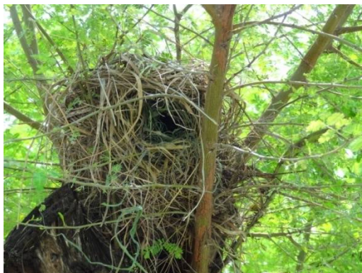
Figure 1: Nest of Spotted Munia on Acacia nilotica

Breeding season of Spotted Munia was initiated in rainy season from end of June and continued till November. However its peak was observed to be during August and September. A total of 24 nests were located in the three stations during 2013-14. It was observed that the nest of Spotted Munia was globular or dome shaped made of grass blades and leaves with a lateral entrance hole oriented mainly along the most frequent wind direction. The majority of the nests was located on the thorny plants species as well as on ornamental trees and shrubs and were placed on twigs towards the centre covered with thick tree canopy.