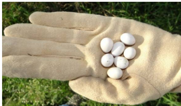
Figure 4: Clutch of 7 eggs