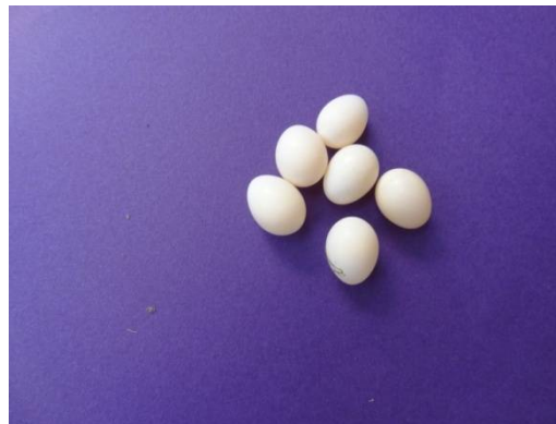
Figure 3: Clutch of 6 eggs