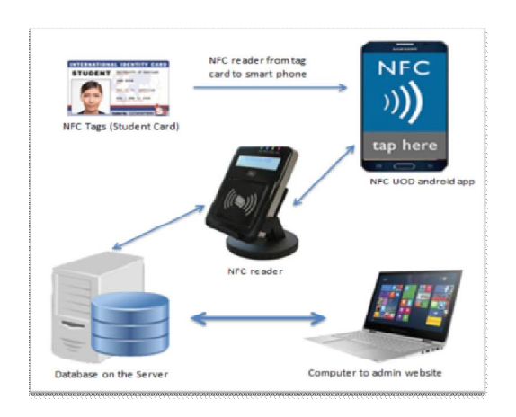
Figure 1: structure of NFC system used for students card

In figure 1.show the Correlation NFC card emulation applications, NFC reader and web applications in the database on the server. The integration of mobile applications and data transfer between them: