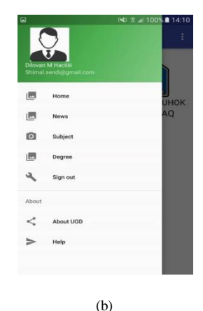
Figure 3: User Interface (a) student ID (b) menue panel

The application is extremely symmetric and user friendly, many services can be accessed easily such as News, subjects and degrees. If selected each item in the menu will display the information as shown in figure 4(a) selected the degree item to show the subject name, then by selecting subject item will display the degree as show in figure 4(b).