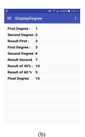
Figure 4: Degree menue (a) main degrees menu (b) selected subject degrees

Web is an important partition of this thesis to control the twice smartphone application of NFC for UOD, using the interaction interface to make easy for entering and controlling the data in database on server .this kind of web are using a web service for student to management the card and application of university, this website is designed with responsive web design to running for all size in screen as show in the figure (5) .the link of web hosting is (http://uod.netau.net). From this website can control the all data of student by the admin. Alsousing this website for register the NFC tag cards by the device NFC Reader ACr122u.