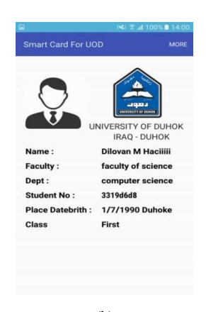
Figure 2:application interface of (a) login page (b) emulate card

The Second application is how the information of students related to the class and subject is called NFC UOD, just by near or touches you smart card running the application. The application firstly will check the UID of NFC card is registered in the database of university or not, if it in database, will display the student details such as the student ID,name, faculty, birth and place, department and classroom number as shown in figure 3(a) by the application can get easily and fast time the information of student like the menu panel as shown in figure 3(b).