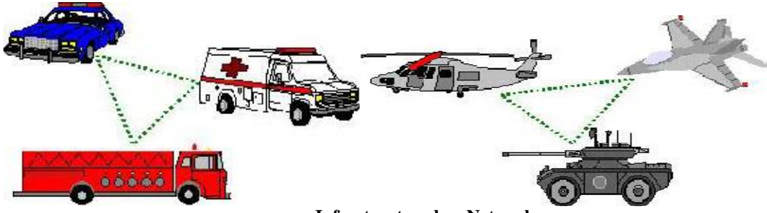
Infrastructure less Network

MANETs does not depend on pre-existing infrastructure or base stations. Network nodes in MANETs are free to move randomly. Therefore, the network topology of a MANET may change rapidly and unpredictably. All network activities, such as discovering the topology and delivering data packets, have to be executed by the nodes themselves, either individually or collectively. Depending on its application, the structure of a MANET may vary from a small, static network that is highly power-constrained to a large-scale, mobile, highly dynamic network. It is a group of autonomous mobile nodes or devices connected through wireless links without the support of a communications infrastructure. The topology of the network changes dynamically as nodes move and the nodes reorganize themselves to enable communications with nodes beyond their immediate wireless communications range by relaying messages for one another, i.e. multi hop.