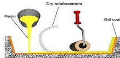
Fig.1 Hand lay-up technique

Hand lay-up technique is the simplest method of composite processing. The infrastructural requirement for this method is also minimal. The processing steps are quite simple. First of all, a release gel is sprayed on the mold surface to avoid the sticking of polymer to the surface. Thin plastic sheets are used at the top and bottom of the mold plate to get good surface finish of the product. Reinforcement in the form of woven mats or chopped strand mats is cut as per the mold size and placed at the surface of mold after per spex sheet. Then thermosetting polymer in liquid form is mixed thoroughly in suitable proportion with a prescribed hardener (curing agent) and poured onto the surface of mat already placed in the mold. The polymer is uniformly spread with the help of brush. Second layer of mat is then placed on the polymer surface and a roller is moved with a mild pressure on the mat-polymer layer to remove any air trapped as well as the excess polymer present. The process is repeated for each layer of polymer and mat, till the required layers are stacked. After placing the plastic sheet, release gel is sprayed on the inner surface of the top mold plate which is then kept on the stacked layers and the pressure is applied. After curing either at room temperature or at some specific temperature, mold is opened and the developed composite part is taken out and further processed.