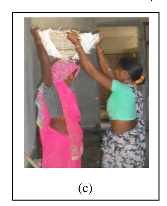
Vol. 5, Issue 9, September 2016

(An ISO 3297: 2007 Certified Organization)