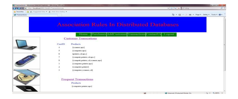
Figure 5: Customer Transactions Page